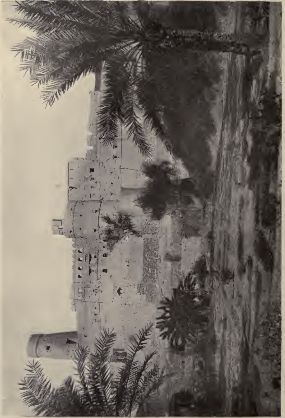
WIND TOWER AND FORT AT BAHILA.