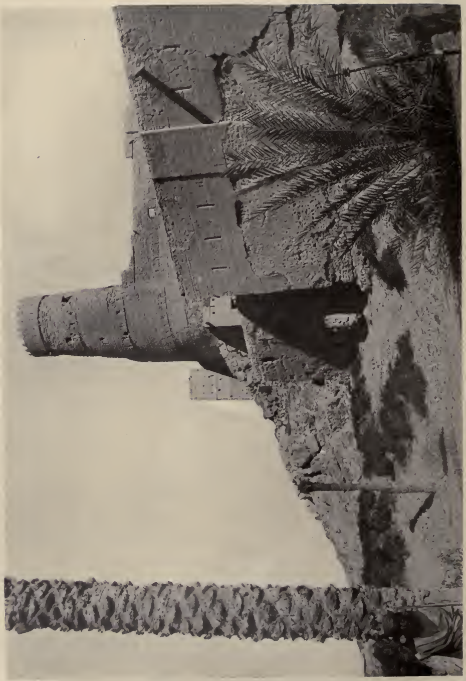
WIND TOWER ON FORT AT BAHILA CALLED BURJ AL-REH.