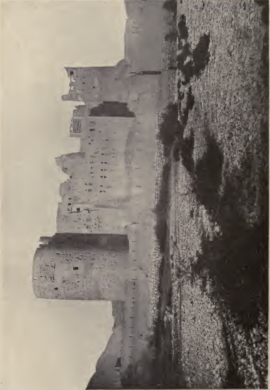
THE OLD FORT OR CASTLE AT ROSTAK.