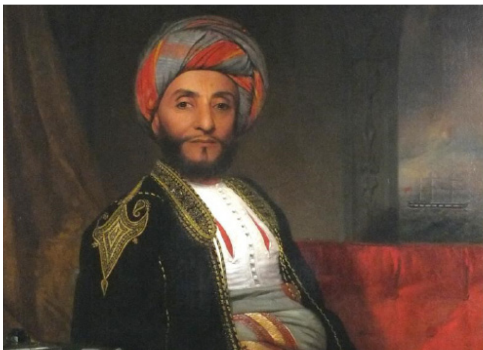
Ahmad Bin No'man Al-Ka'abi, first Arab Envoy to the United States of America in 1840

Following the death of Sayyid Said Bin Sultan in 1856, (28) Omani-American relations reached an impasse due to conditions resulting from the partition of the Omani Empire and Lord Canning's decision to sever Zanzibar from Muscat in 1861. The situation was further exacerbated by subsequent domestic conflicts in Oman between the sons of Sayyid Said Bin Sultan. Additionally, trade and economic activity declined while the USA opted for a policy of self-containment as the Civil War erupted between 1861 and 1865. (29)