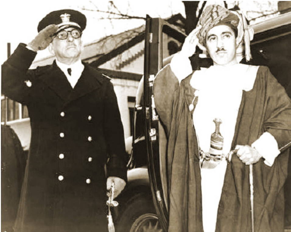
Visit by Sultan Said Bin Taimur to the USA in 1938

The US States Department informed the British Ambassador in Washington about the visit which was about to take place and assured him that it was a friendly visit and had no political repercussions. The visit was duly publicized against Britain's wishes as Sultan Said Bin Taimur arrived at the American capital in Washington, DC in March 1938 being the first ever Arab ruler to visit the USA. He was given a red carpet reception with the US President, Franklin Roosevelt, at the head of the well-wishers gathered to welcome the Sultan. Talks between the two sides focused on the discovery of oil in Oman and review of provisions of the 1833 Treaty. (44)